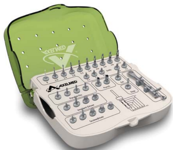
Complete Surgery Kit