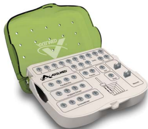
Empty Surgery Box